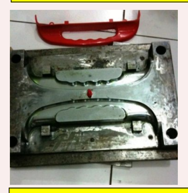
Damages on plastic mold. Repair with 330 T or 728 T (GTAW)