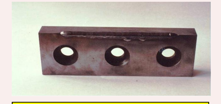
Damage and wear on cutting knives: Repair with ARCWEL 330 T /7201 T