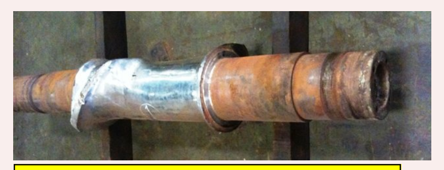
Wear on Rubber Kneader (mixer) GOLD 330