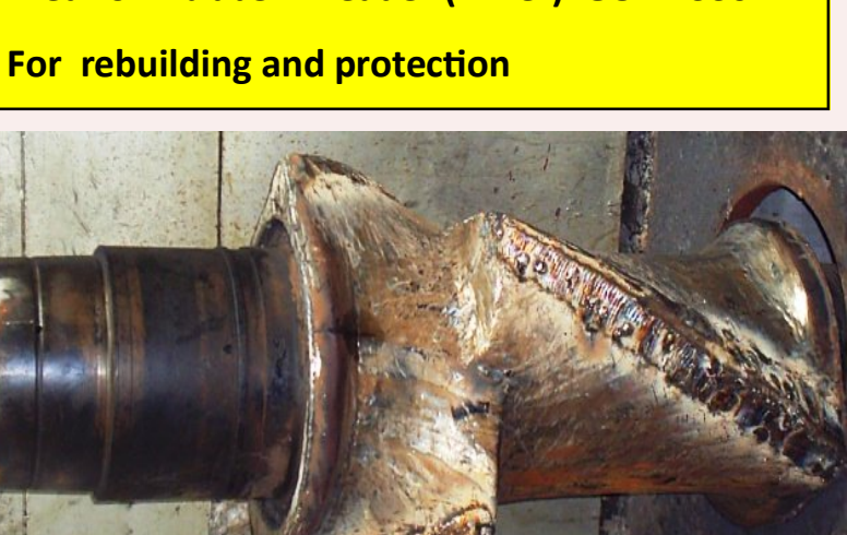
Rubber Mixer / GOLD 330- for restoring HB 50 CO or long term protection/ hardfacing