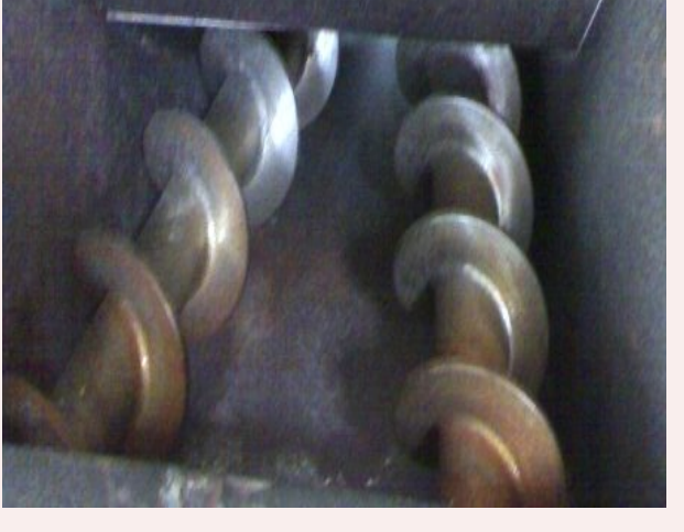
Wear on conveyor and extrusion screws. Repair with GOLD 330 and hardface GOLD 730